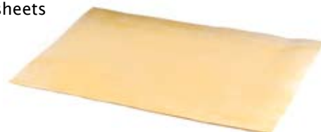
Danish pastry sheets mm 4 pcs 19