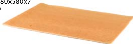
Vanilla sponge sheet mm 380x580x7 pcs 9