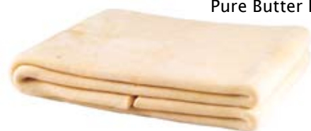
Pure Butter Puff Pastry slabs 2 x 5 kg