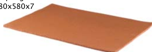
Chocolate Sponge sheet mm 380x580x7 pcs 9