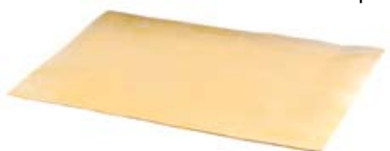
Puff pastry sheet butter 2,5 mm 14 sheets