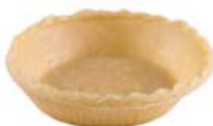
Tartelette pure butter 8,5 mm 144 pcs