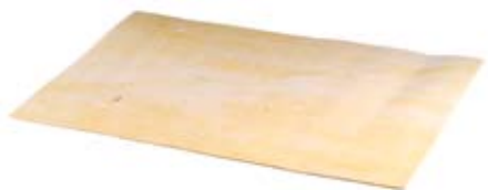
Puff pastry sheet 3,5 mm 11 sheets